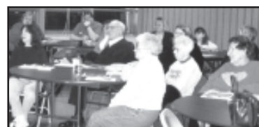
Lansing City Council and some CVNA members