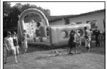
City of Lansing Parks and Recreation Obstacle Course