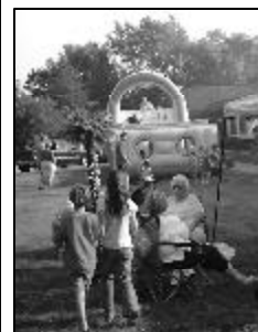
Lollipop Tree a favorite