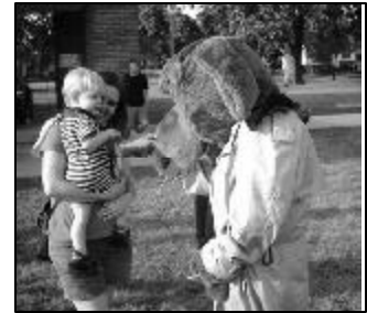
McGruff the Crime Fighting Dog & Fans