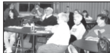
Lansing City Council and some CVNA members